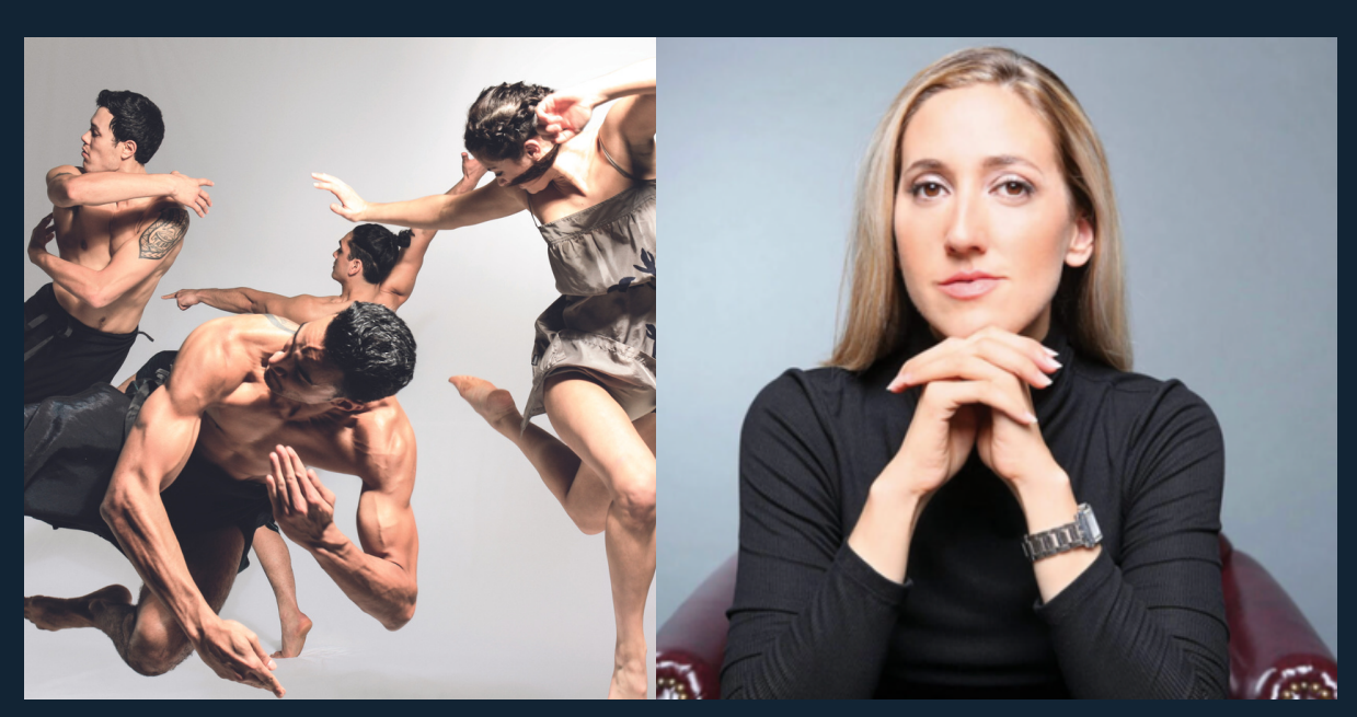
Black Grace